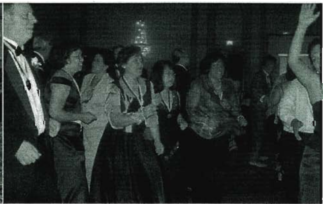
Seventy-Niners Strutting Our Stuff