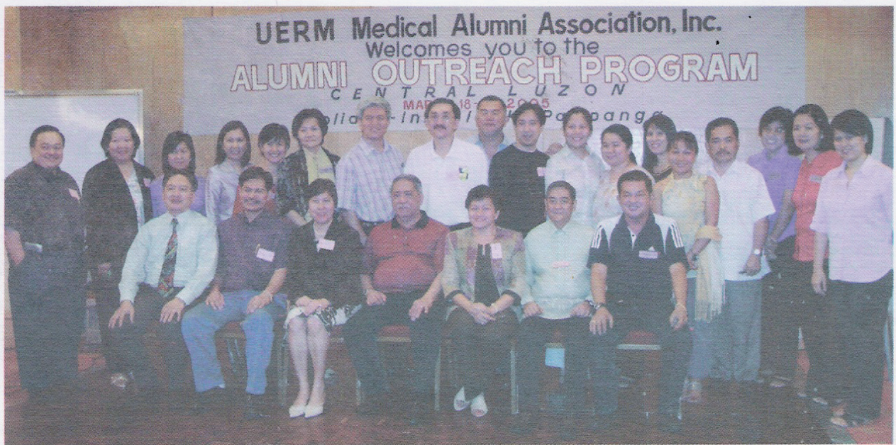
1st Alumni Regional Assembly and Scientific Meeting in Clark Pampanga