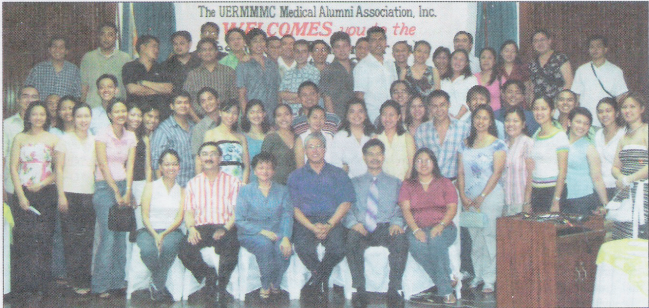
Class 2005 with members of the UERM Faculty and the Alumni Board