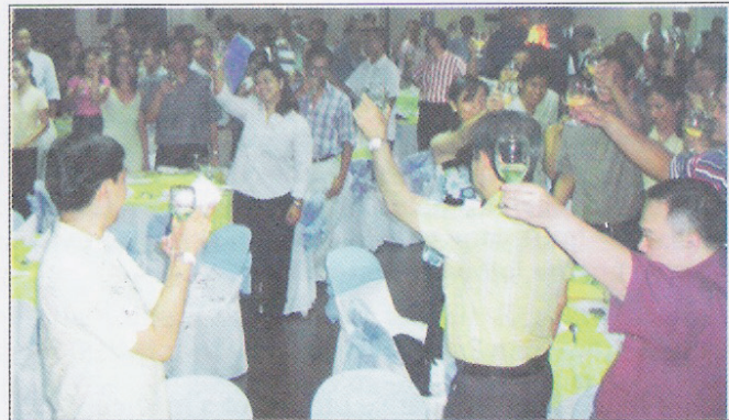
Cheers to the graduates!!!