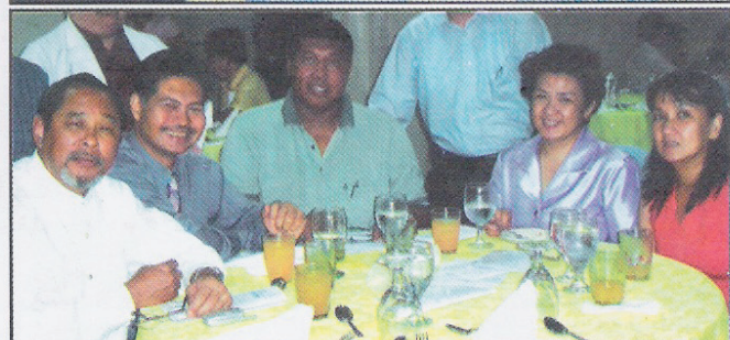
Officers, Department Heads and Faculty Members during the Testimonial Dinner