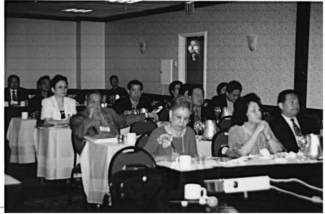
Annual session had a morning seminar and afternoon-business meetings by itself and with the association.