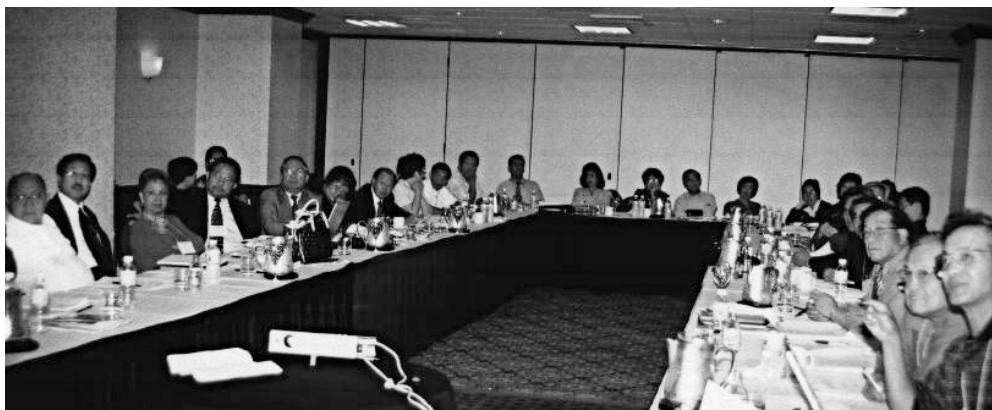
Annual meeting participants listen to an array of speakers on August 4, 2004