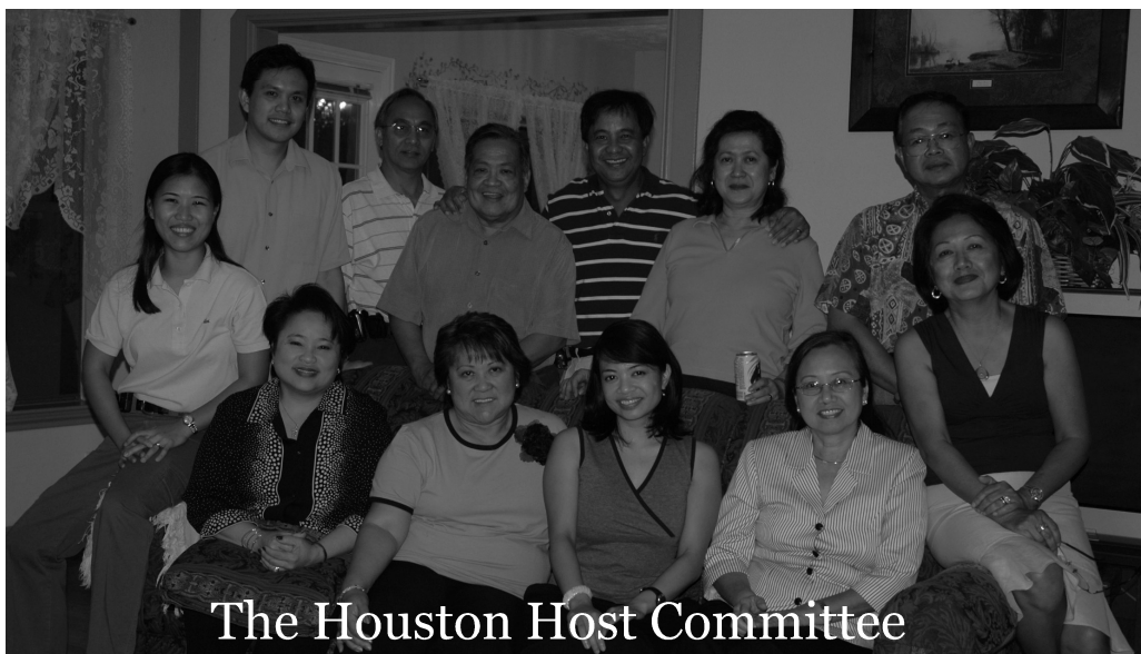
The Houston Host Committee