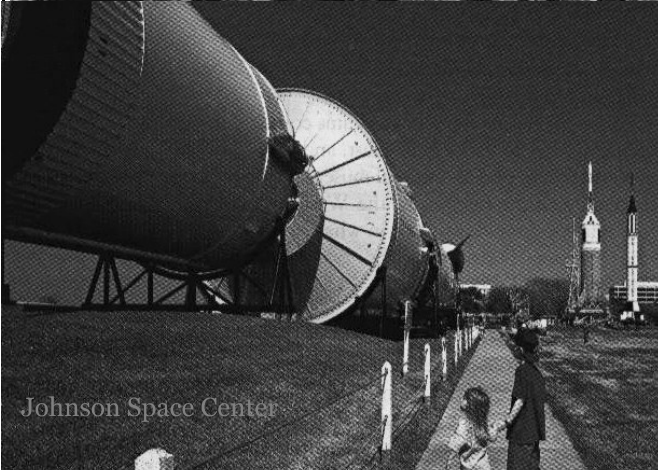
Johnson Space Center