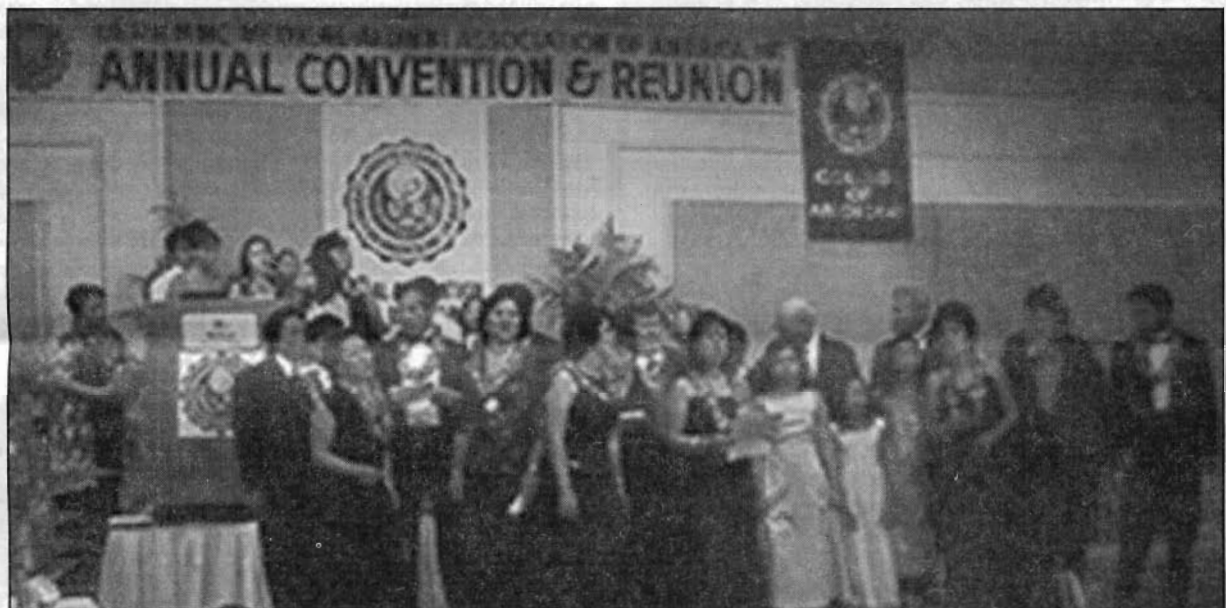
Silver Jubilarian Class 1977's Mighty Twelve and their families belt out a popular high school graduation song for the gala audience in Hawaii, August, 2002. The class put two speakers in the CME program and got three of them elected officers of the national alumni association. After their homecoming in December, 2002 at UERM, the class pledged $100,000 for the alumni foundation's scholarship program. Bravo!