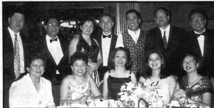
Assorted Classes, '82 to '99, Our Youth, Our Future, Our Hope!