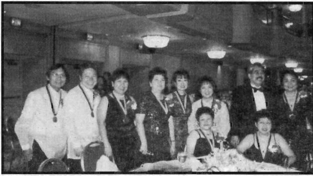
'76 Silver Jubilarians at the Gala