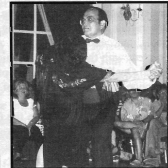
Tango the '61 Way