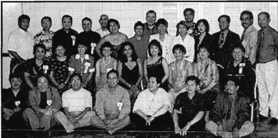
Silver Jubilarians, A Treasure for 25 Years