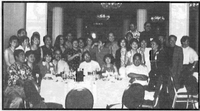
at their Batch Night