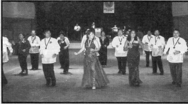
... and at the Dance Floor. Mambo!