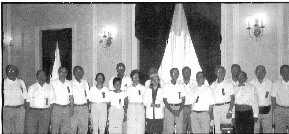
Ruby Jubilarians, The Pioneer Class After 40 Years