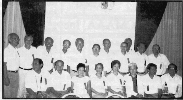
Indomitable Class '61, they showed us their way, a tough act to follow! Viva!