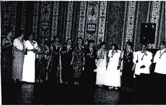
Silver Jubilarian Class of 1975 presented with medallions and