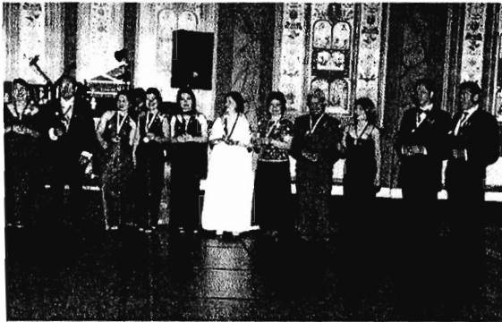
perform the traditional candle light ceremony at the gala night.