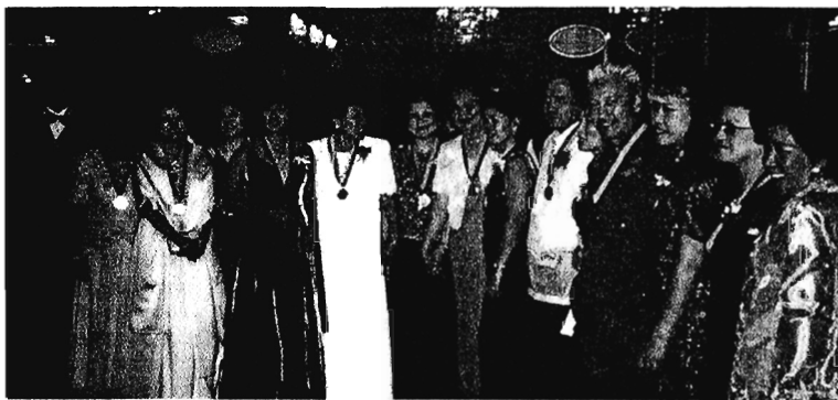
Members of the Silver Jubilarian Class of 1975 celebrate at the annual convention gala.

Las Vegas - The UERMMMCA Medical Alumni Association in America, Inc. held its 12th national convention and reunion last August 2-5 at the Paris Hotel Resort and Casino in Las Vegas. The four day millennium meeting attended by about 400 alumni and their families consisted of a golf tournament, an eight-hour continuing medical education program, jubilarian class parties, gala dinner-dance, and business meetings.