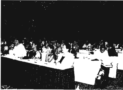
Participants listen attentively to the CME and general assembly meetings.