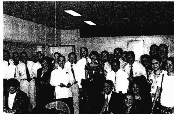
Happy also are the faces of Silver Jubilarian Class '74 at their December, 1999 reunion in Manila.